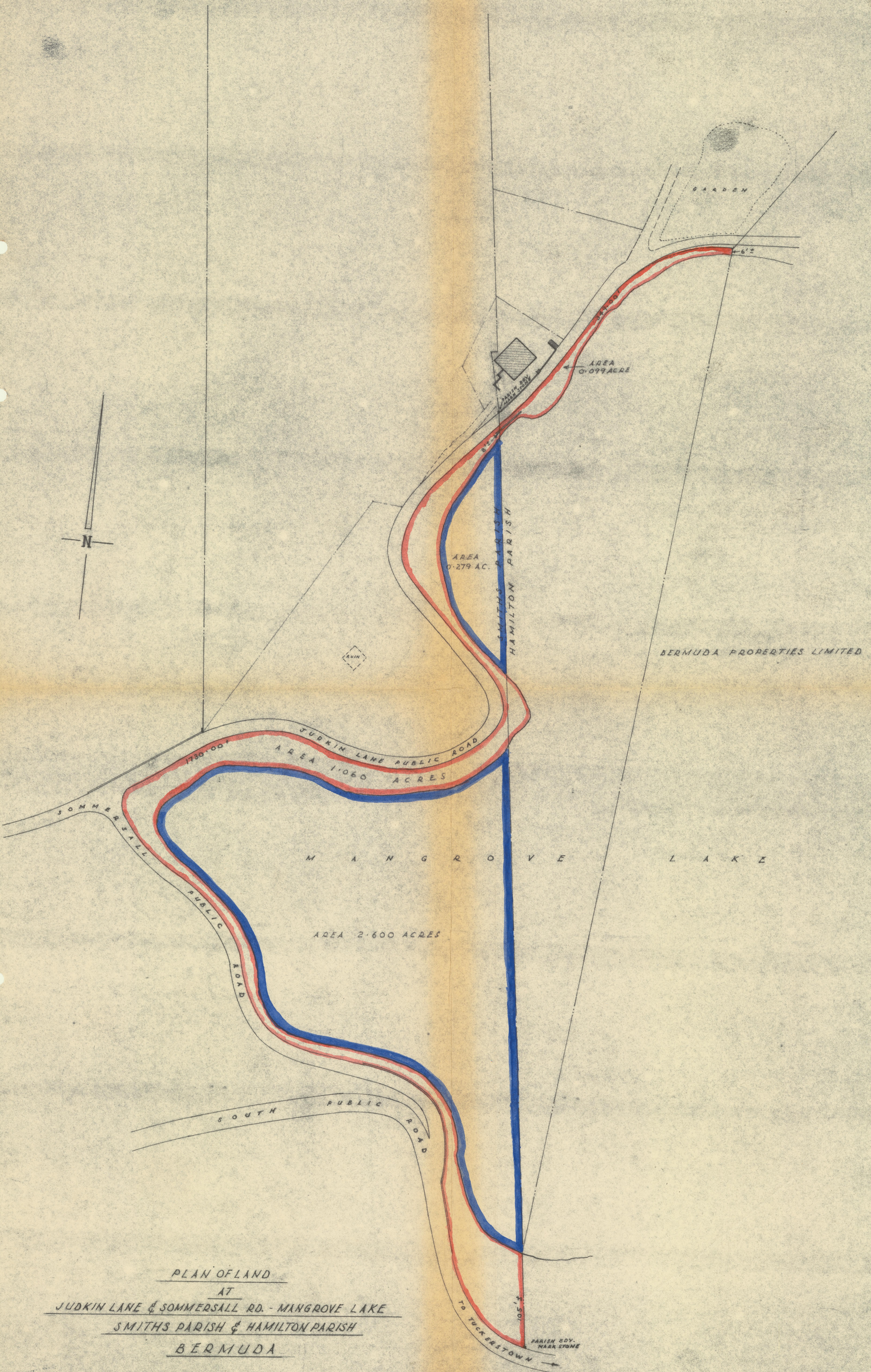
PLAN OF LAND AT JUDKIN LANE & SOMMERSALL RD. - MANGROVE LAKE SMITHS PARISH & HAMILTON PARISH BERMUDA